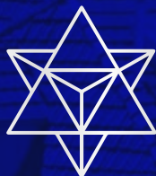
SILVER 10,000 €