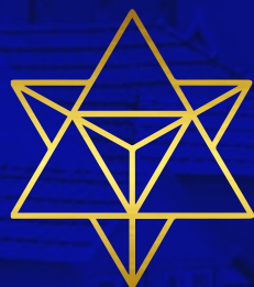
GOLD 20,000 €