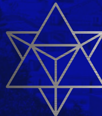
PLATINUM 40,000 €